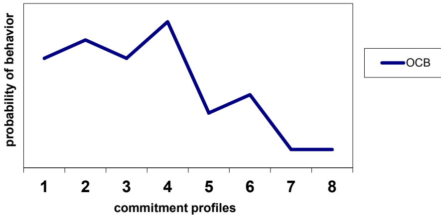
Figure 2. Probability of organizational citizenship behavior expected for different commitment profiles.

assumed that frequency of discretion behaviors displayed by employees depended on the intensity of their commitment profile. Their theoretical model combines eight commitment profiles with intensity in terms of discretionary behavior (OCB). Pertaining to previous research (Meyer et al., 2002; Morisson, 1994), Meyer and Herscovitch (2001) presumed that organizational citizenship behavior had the highest correlation with affective commitment, thus, the likelihood of OCB should be greatest in the case of “pure” affective commitment (i.e. where the other forms are weak), followed by the cases in which affective commitment was accompanied by high levels of normative or continuance commitment. Regarding profiles with low levels of affective commitment, Meyer and Herscovitch (2001) expected that a “pure” normative commitment profile would be stronger associated with OCB than a profile characterized by high levels of normative and continuance commitment or “pure” continuance commitment. Continuance commitment seemed to attenuate the impact of affective and normative commitment on positive work-related behavior (OCB), (Meyer & Herscovitch, 2001; Wasti, 2005). The pattern of expected relations between commitment profiles and discretionary behavior is presented in a Figure 2.